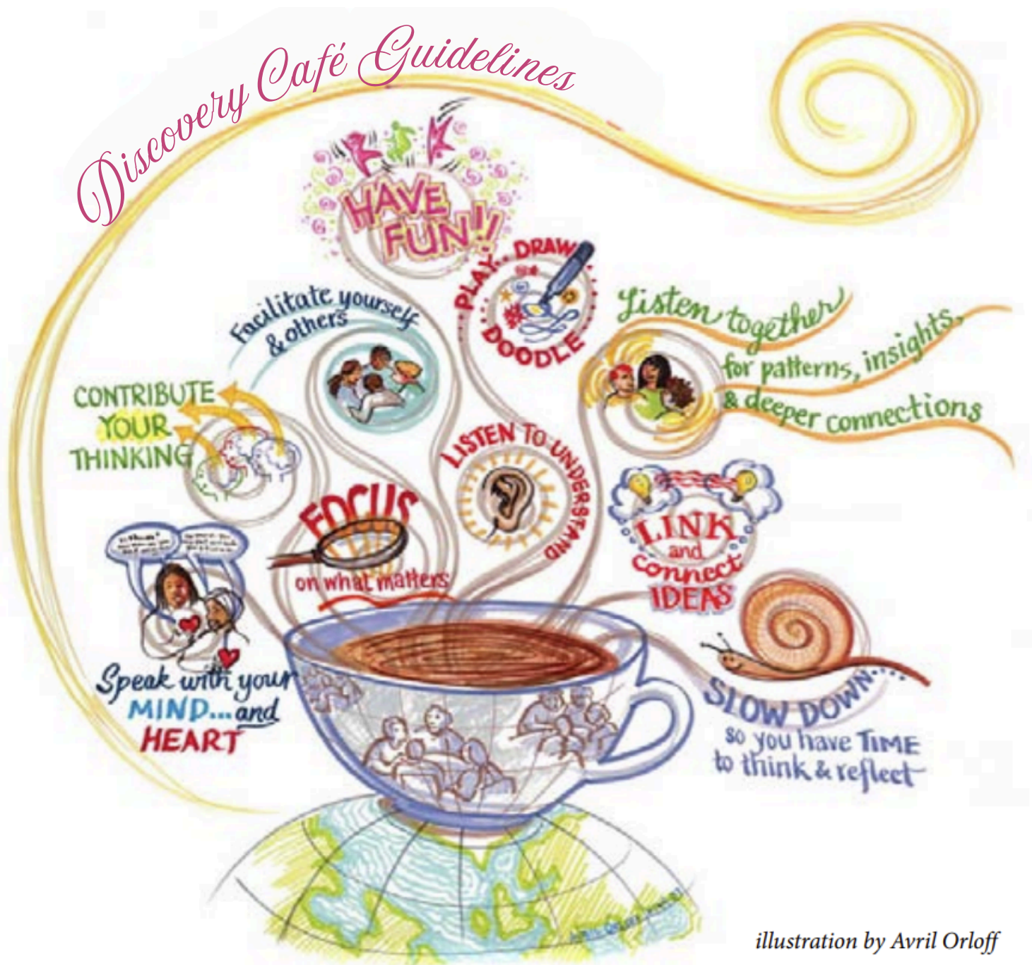
illustration by Avril Orloff